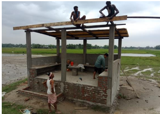
Construction of Resting Shed, Barpeta