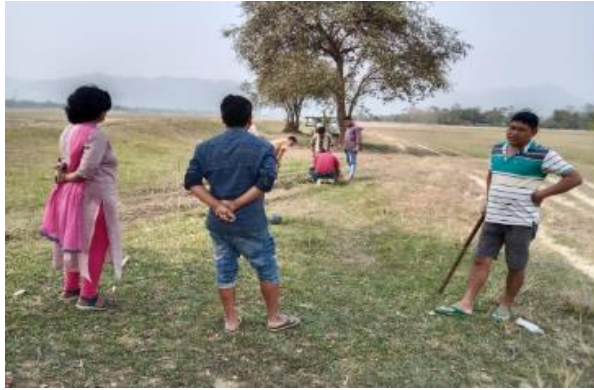
Resting Shed, Dhemaji