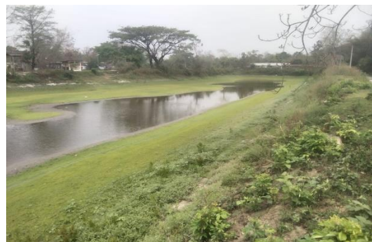
Community Pond, Barpeta