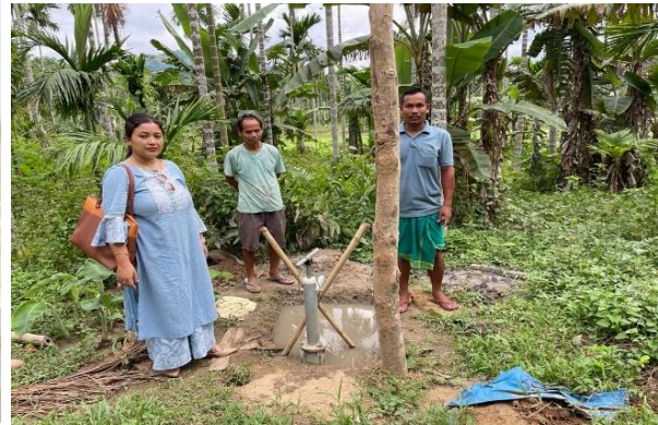
Tara Pump, Kamrup