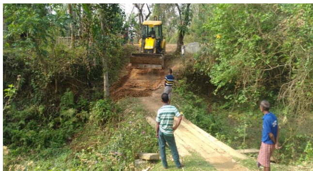
Culvert - Bongaigaon

Some of the works undertaken under EPA during this period are shown below: