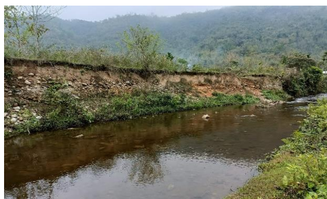
Boulder Revetment, Karbi Anglong (Kohora)