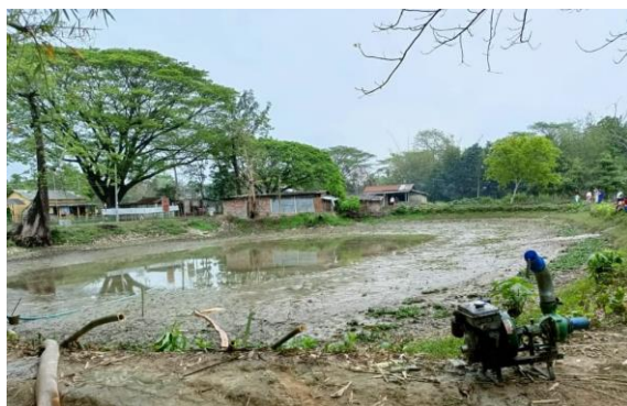
Community Pond, Baksa