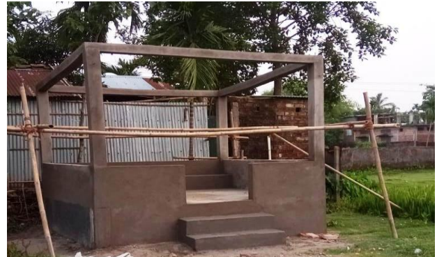
Resting Shed- Dhubri